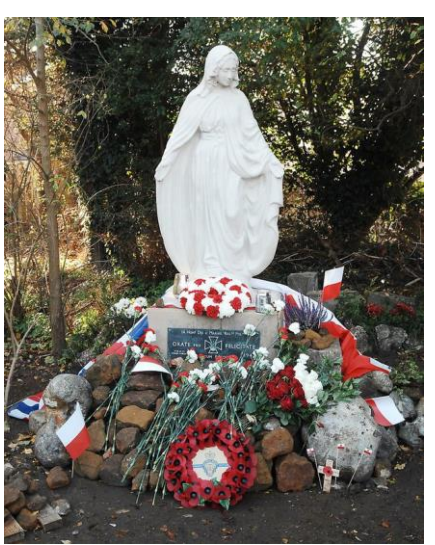
The new shrine as dedicated