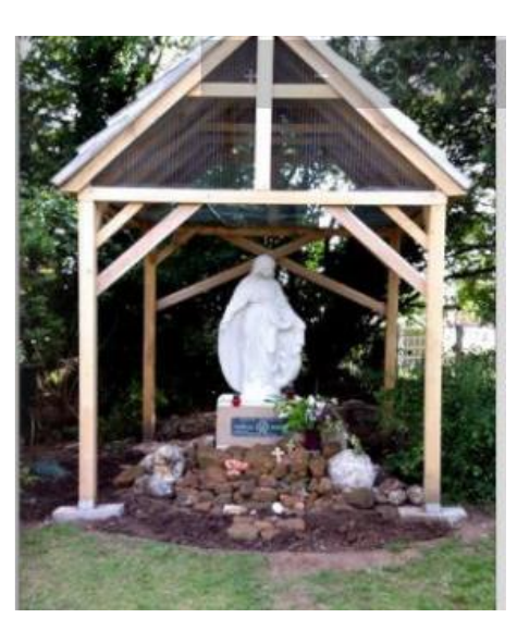
Now complete with protection

The more she became involved in her project the more she recognised how important it is to pay attention to, and respect, the past actions of people who have played significant parts in our history. Her own nationality of course linked her directly to the Polish soldiers, and she was in an excellent position to organise support and funds to put the new memorial in place. All of which she achieved in honour of a group of men who, as part of the army in the name of Poland, joined the war effort in this country to help it against the Germans.